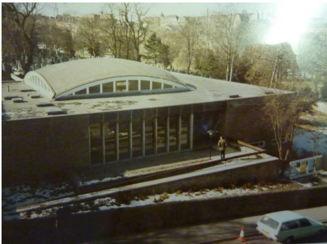
Figure 2. The meeting house prior to removal of the dome (undated photograph)

The new burial ground lay immediately beside Nottingham General Cemetery which had been founded in 1836. A part of this site which had not been used for burials was used to build a new meeting house which was completed in 1961. The building was designed by the architects Bartlett & Gray, project architect Colin Gray. The practice also designed meeting houses in Chesterfield and Mansfield (qq.v.). The principal space originally had a laminated timber dome, of elliptical paraboloid form, engineered by Hume & Tottenham. The building received a regional RIBA award in 1963, recorded on a bronze 'architecture medal' plaque in the entrance hall, which records the name of the architect Colin Gray and identifies the building as 'The most meritorious building erected within the counties of Lincolnshire, Derbyshire and Nottinghamshire during the three years ended 31.12.1963.'